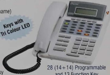
KX - 30

28 (14+14) Programmable and 13 Function Key